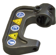
Rivet Clamp NB 40