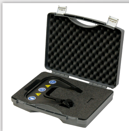
Rivet Clamp NB 115 #CHR2204