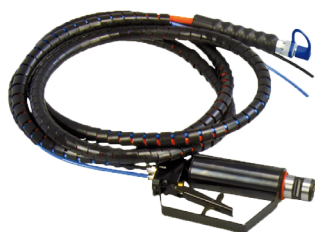
Hydraulic Gun HP 35 UN