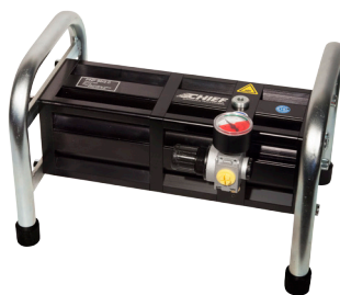
Pressure Intensifier PNP90