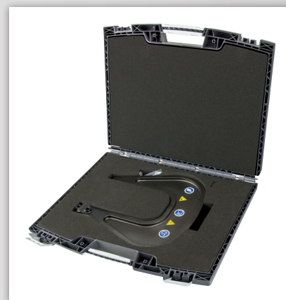
Rivet Clamp NB 230 #CHR2203