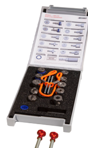
Riveting Tool Kit Locking Bolts